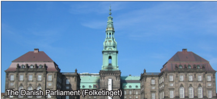
The Danish Parliament (Folketinget)

The leadership of the OSCE Parliamentary Assembly will meet in the Danish Parliament (Folketinget) next week for its spring Bureau meeting to discuss ongoing work, with a particular focus on the upcoming Annual Session in Minsk.